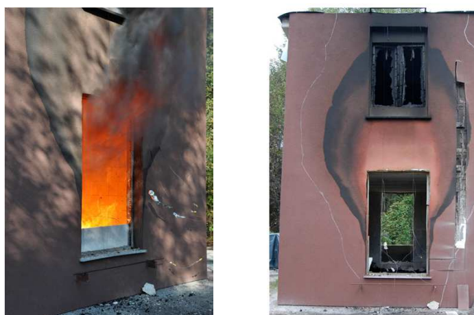
Façades in Fire Seminar