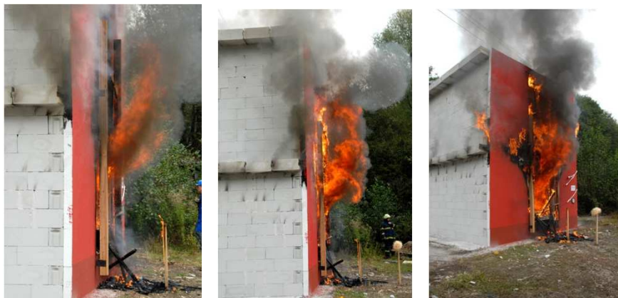
Façades in Fire Seminar